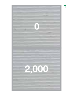
were exposed to an accelerated QUV test of 2,000 hours under ASTM G154-12a.