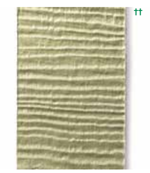
including Marietta, GA, Flagstaff, AZ, and Orange County, CA. ++Images depict undamaged HardiePlank® lap siding and wood-based siding exhibiting woodpecker damage.