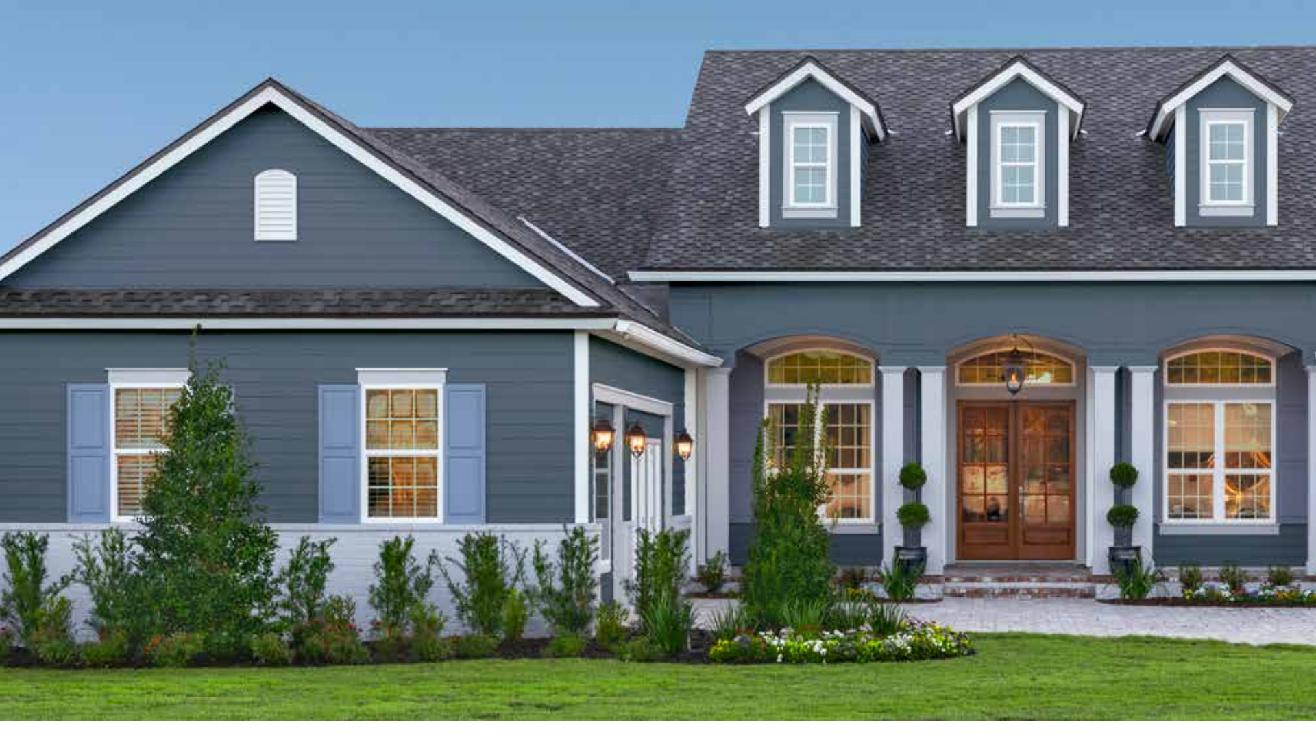
HardiePlank® Lap Siding Select Cedarmill® Evening Blue HardieTrim® Boards Smooth Arctic White